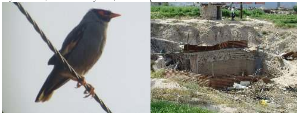
Left: Bank Myna Jahra Farms 7 th April 2007

Eastern Imperial Eagle 1(2cy), Laughing Dove C, White-throated Kingfisher 1, Cuckoo 2, Tree Pipit 3, Redstart 2, Nightingale 1, Chiffchaff C, Semi-collared Flycatcher 1, Common Myna C, Bank Myna 2+, Ortolan 1