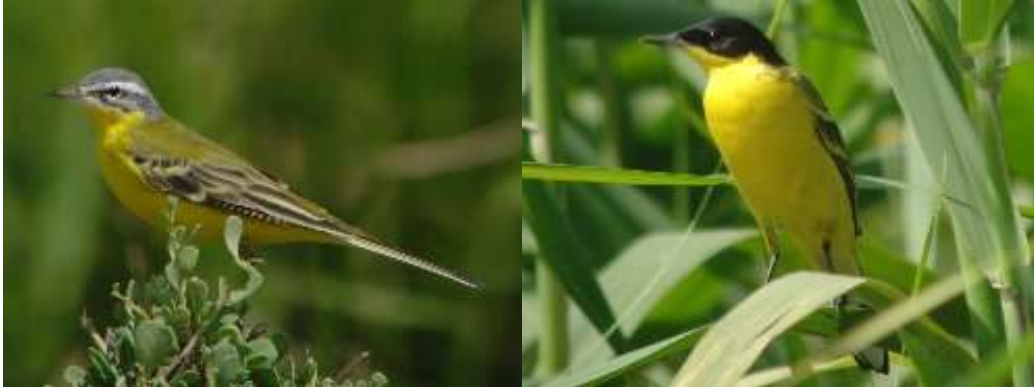
Left: Yellow Wagtail Motacilla flava beema Jahra East 3 rd April 2007

Cormorant 4, Squacco 8+, Western Reef Egret 1, Purple Heron 2, Black-winged Stilt 2, Black-winged Pratincole 28, Collared Pratincole 1, Grey Plover c.10, Ruff 4, Common Sandpiper 4, Slender-billed Gull C, Black-headed Gull c.30, Great Black-headed Gull 1(2cy), Heuglin's Gull 3, Caspian Tern 15+, Little Tern 1, Sand Martin 2, Red-throated Pipit C, Yellow Wagtail 100s, Isabelline Shrike 1(phoenicuroides)