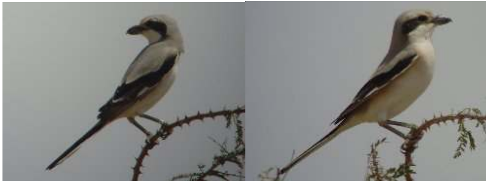
Steppe Grey Shrike Lanius meridionalis pallidirostris Tulha 7 th April 2007

Individuals of the race pallidirostris (Steppe Grey Shrike) noted at Zour Port/Pipeline Beach 6 th April, Tulha 7 th April and Sabah Al-Ahmad 8 th April. A bird of the race aucheri was noted at Sabah Al-Ahmad 7 th April.