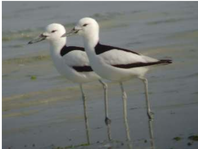
Crab Plover Doha Spit 6 th April 2007

We only saw this species at Doha Spit as we did not have the chance to visit Bubiyan Island where spectacular numbers breed. Records from Doha Spit included 3 on 3 rd April, 1 on 5 th April and 6 on 6 th April.