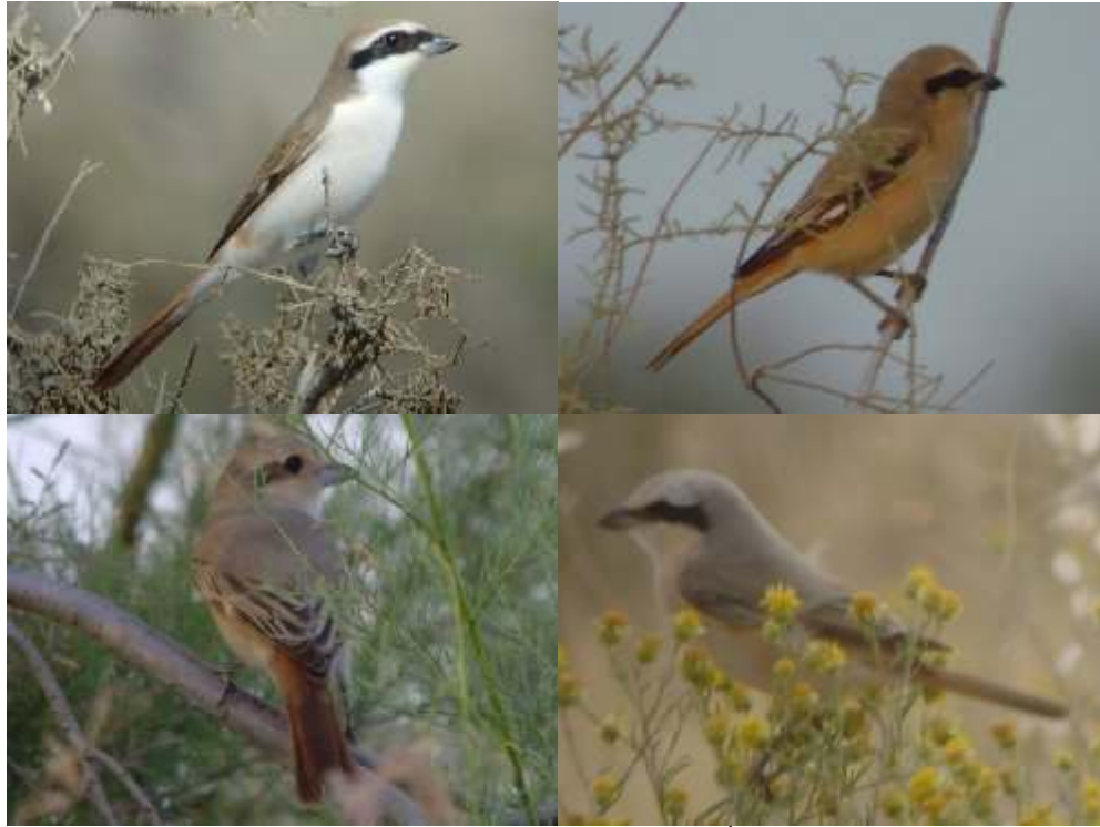
Above left: male phoenicuroides (Turkestan Shrike) Zour Port 6 th April 2007 Above right: male isabellinus (Daurian Shrike) Sulaibhikat 5 th April 2007 Below left: female isabellinus (Daurian Shrike) Sulaibhikat 5 th April 2007 Below right: male isabellinus (Daurian Shrike) Kabd 8 th April 2007