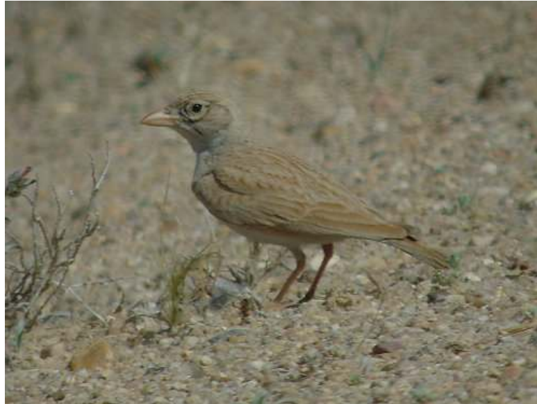
Dunn's Lark Sabah-al-Ahmad 7 th April 2007