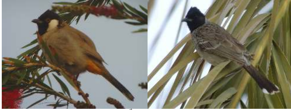
Left: White-cheeked Bulbul Green Island 4 th April 2007