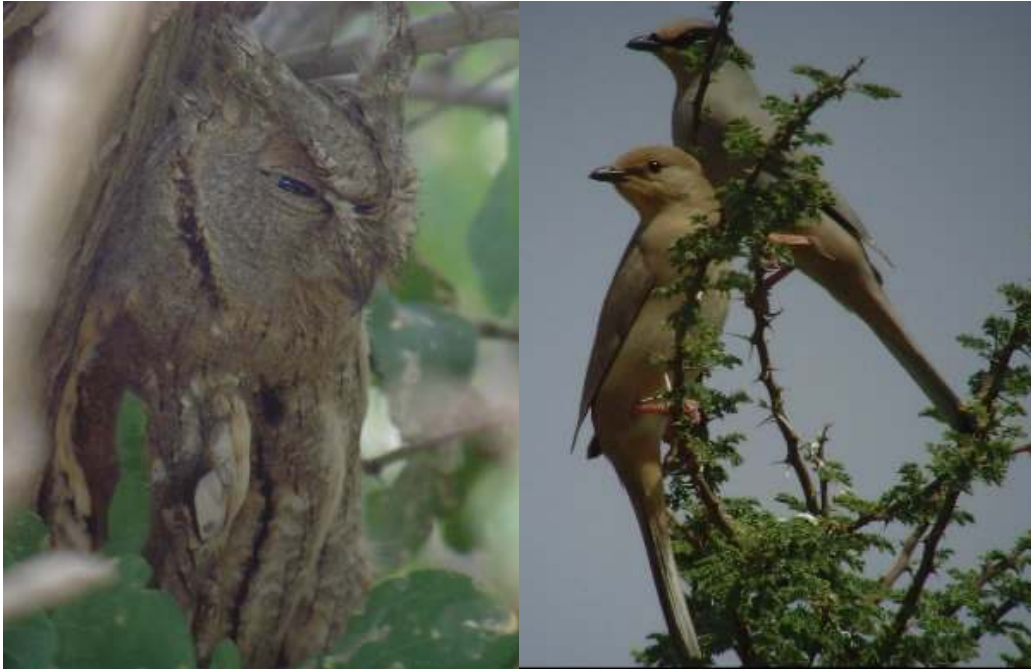
Left: Scops Owl Tulha 4 th April 2007

Dunn's Lark 6, Hoopoe Lark 3, Bar-tailed Lark 1, Short-toed Lark c.15, Crested Lark C, Swallow C, Tawny Pipit c.5, Yellow Wagtail 2, Northern Wheatear 1, Southern Grey Shrike 1(aucheri), Woodchat 1