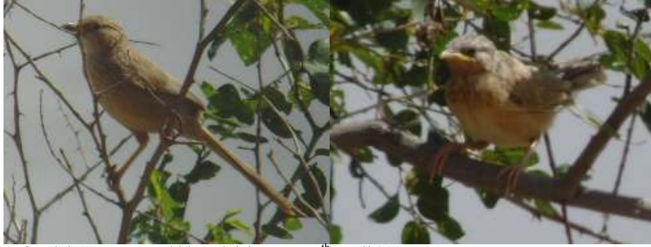
Left: adult Common Babbler Abdaly Farms 5 th April 2007 Right: juvenile Common Babbler Abdaly Farms 5 th April 2007