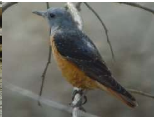
Left: Ortolan Sulaibhikat 3 rd April 2007