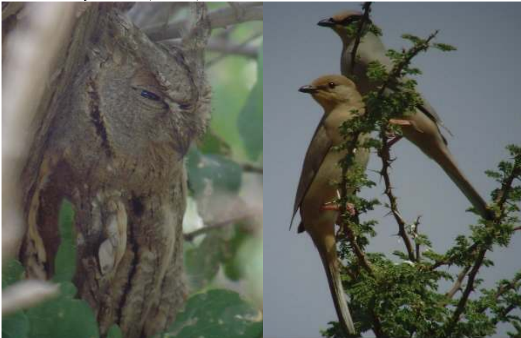
Left: Scops Owl Tulha 4 th April 2007

Dunn's Lark 6, Hoopoe Lark 3, Bar-tailed Lark 1, Short-toed Lark c.15, Crested Lark C, Swallow C, Tawny Pipit c.5, Yellow Wagtail 2, Northern Wheatear 1, Southern Grey Shrike 1(aucheri), Woodchat 1