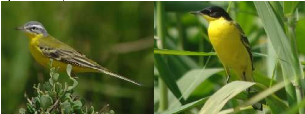
Left: Yellow Wagtail Motacilla flava beema Jahra East 3 rd April 2007

Cormorant 4, Squacco 8+, Western Reef Egret 1, Purple Heron 2, Black-winged Stilt 2, Black-winged Pratincole 28, Collared Pratincole 1, Grey Plover c.10, Ruff 4, Common Sandpiper 4, Slender-billed Gull C, Black-headed Gull c.30, Great Black-headed Gull 1(2cy), Heuglin's Gull 3, Caspian Tern 15+, Little Tern 1, Sand Martin 2, Red-throated Pipit C, Yellow Wagtail 100s, Isabelline Shrike 1(phoenicuroides)